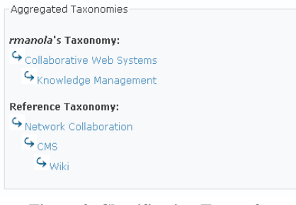
Figure 3. Classification Trees of a document